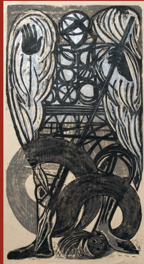
Below: Checklist # 95