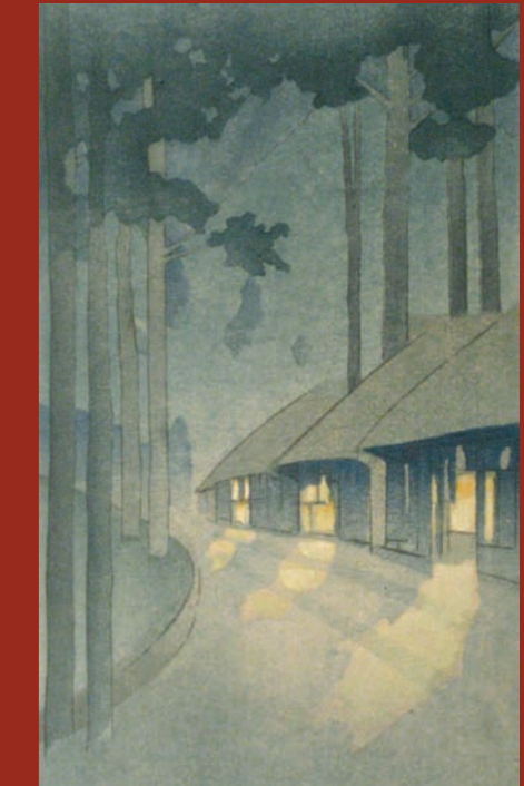
Checklist # 47