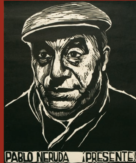
Checklist # 70