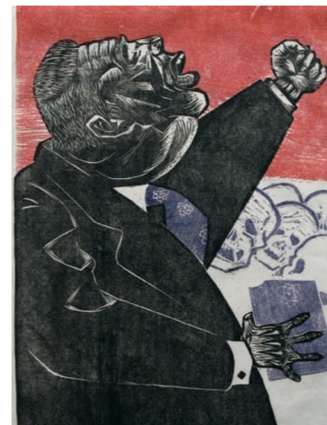
Below: Checklist # 44