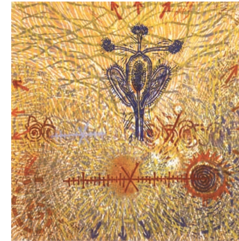
Checklist # 48