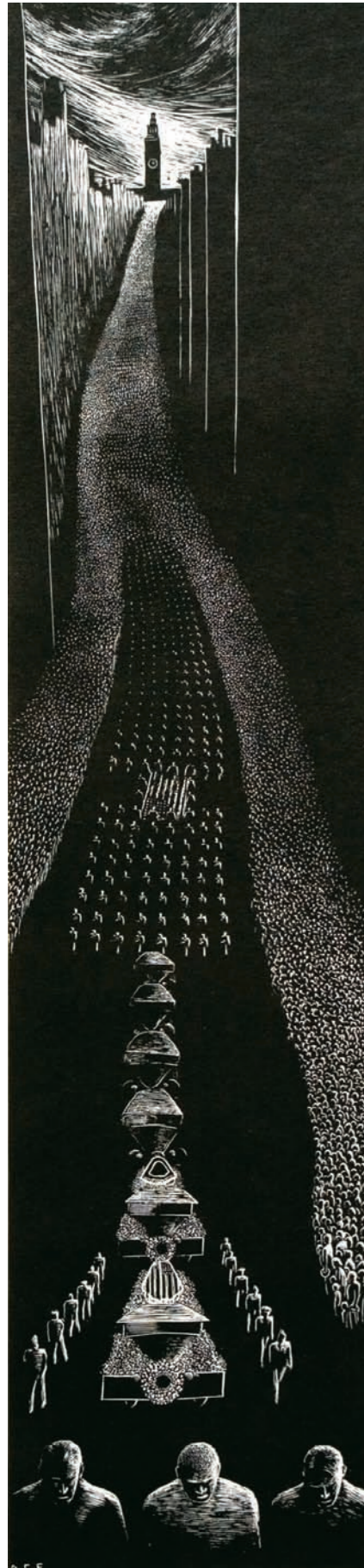
Checklist # 18