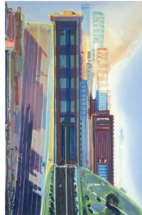
Checklist # 85