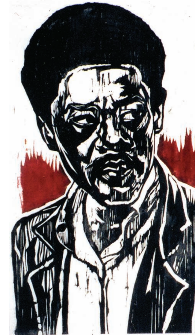
Cover: Checklist # 71

THIS TIME LOST BUT NOT FOREVER. TOMORROW THE CAUSE WILL RISE AGAIN...STRONG WITH WISDOM AND DISCIPLINE.