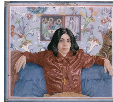
Checklist # 92