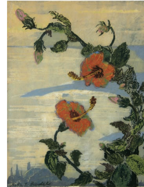
Checklist # 35