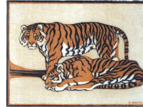
Checklist # 52