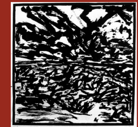
Checklist # 91